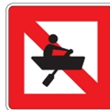
no through passage for paddleboats