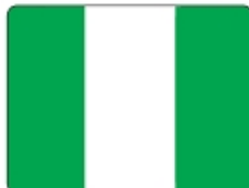
pass through allows