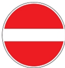
allowed to paddleboats