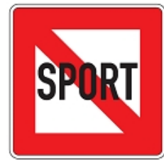
no through passage for paddleboats